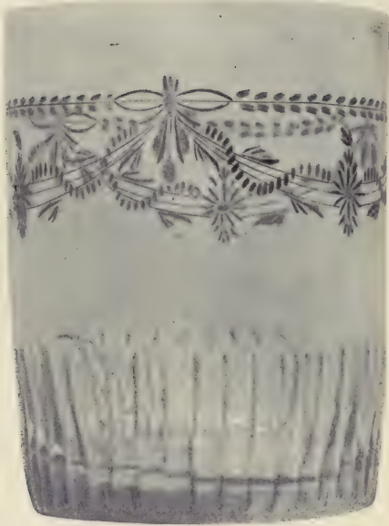
TUMBLER San Ildefonso